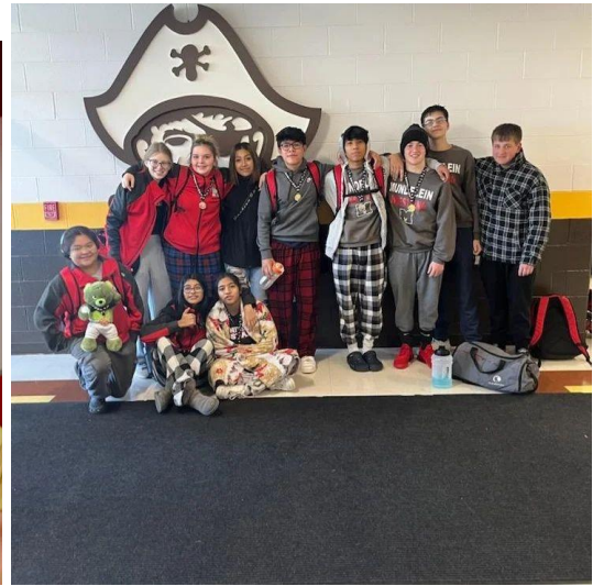
Boys Basketball Coaches Corner