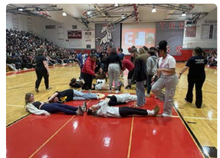
Students work together to form letters across the gym