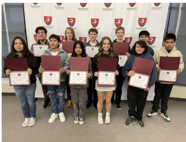
March Mustang Pride Award recipients