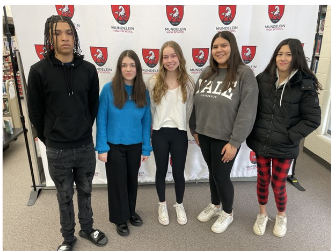
February Mustang Pride Award recipients

The award recognizes students for demonstrating one of our Profile of a Learner tenets: Agile; Self-Assured; Proactive; Information-Seeking; Resilient; and Empathetic.