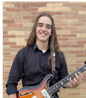
Junior - Guitar, auxiliary percussion

Thoughts on the Band Program — It has helped me to grow in a hobby of mine that I absolutely love, and for that, I am truly grateful. I now feel more confident as a performer and a musician, as well as being more well-rounded musically for when I hope to gig out after high school.