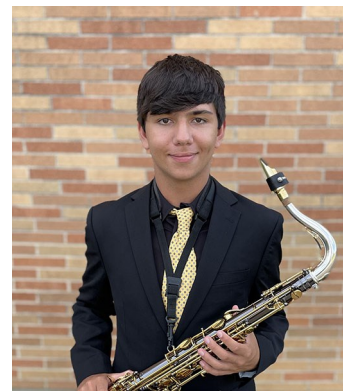
Junior - Tenor saxophone, flute, bass clarinet

Other thoughts — Jazz has given me new perspectives to music. Without learning how music can be linked to emotions, I wouldn't have these special connections to songs that I otherwise wouldn't even think about listening to.