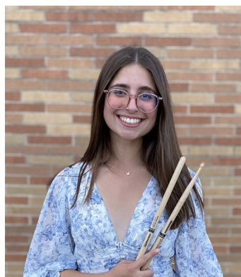
Junior - Drum Set, auxiliary percussion