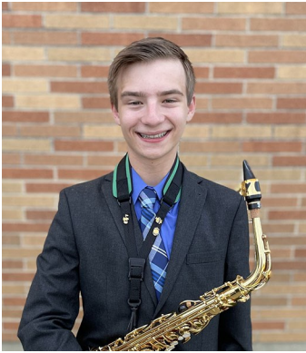
Junior - Alto Saxophone, flute, soprano saxophone