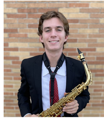
Senior - Alto Saxophone, flute

Thoughts on MHS Band — The entire program has been nothing short of a blessing. I've gotten to meet countless people, some of whom have become some of my closest friends, as well as gotten to watch myself grow to levels I never saw being possible for me. MHS Band: I owe pretty much everything, no matter what happens, it'll always have a special place in my heart.