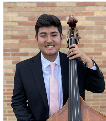
Senior - Bass, auxiliary percussion

Thoughts on the band program — MHS's music program is a special part of the school in my opinion and the most outstanding program we have. The opportunities it has offered are invaluable.