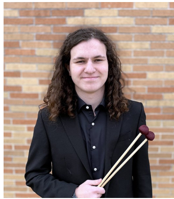
Sophomore - Vibraphone, bass, auxiliary percussion