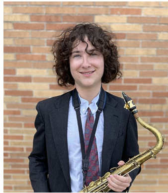
Senior - Tenor Saxophone, Alto Saxophone, flute, clarinet

Thoughts about the Band Program — The Mundelein Band program means so much to me. From all of my friends to our great directors, I take pride in knowing I'm a part of it. I could not envision my life without music and in turn without our amazing program. Even when I'm having a bad day, band has been there to brighten my mood.