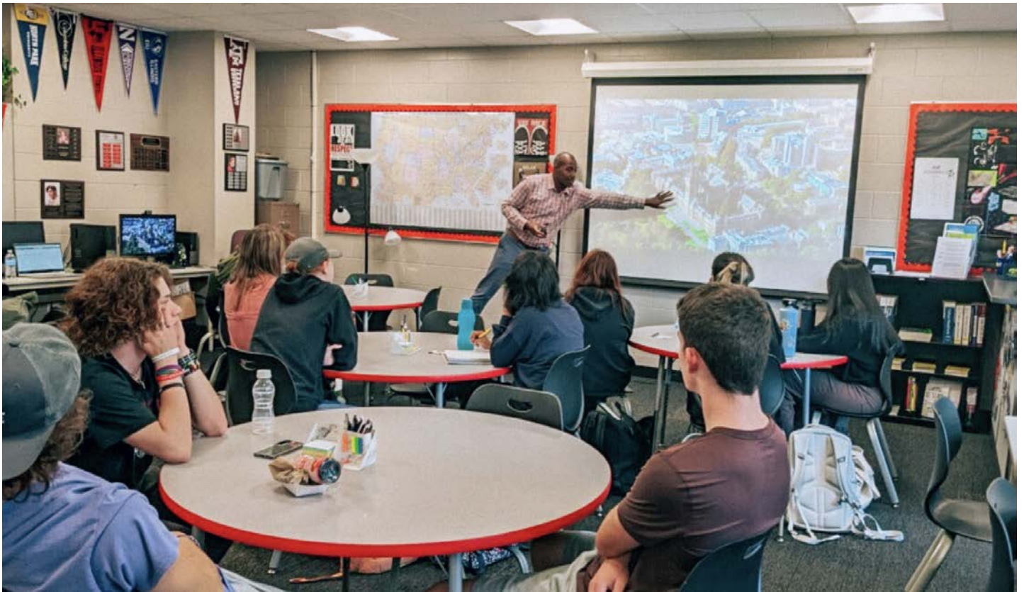
University of Glasgow (Scotland)