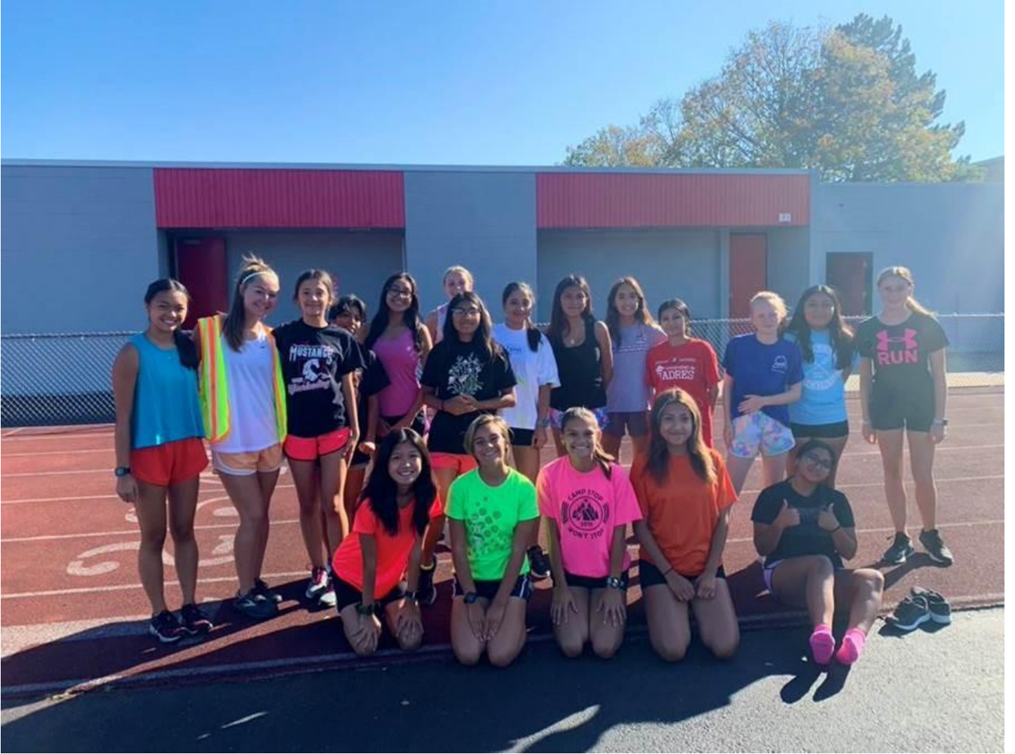
Day #1 of Homecoming Week practice spirit days: Neon Day!