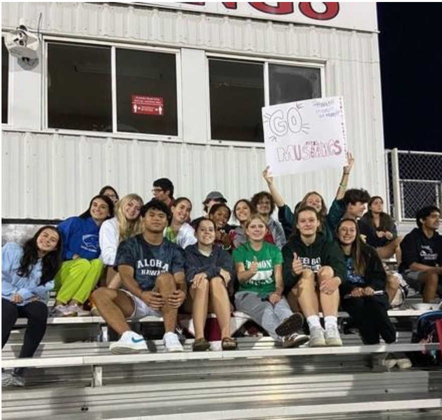
Boys Soccer crowd