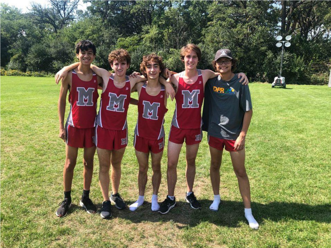
The Varsity squad at Warren