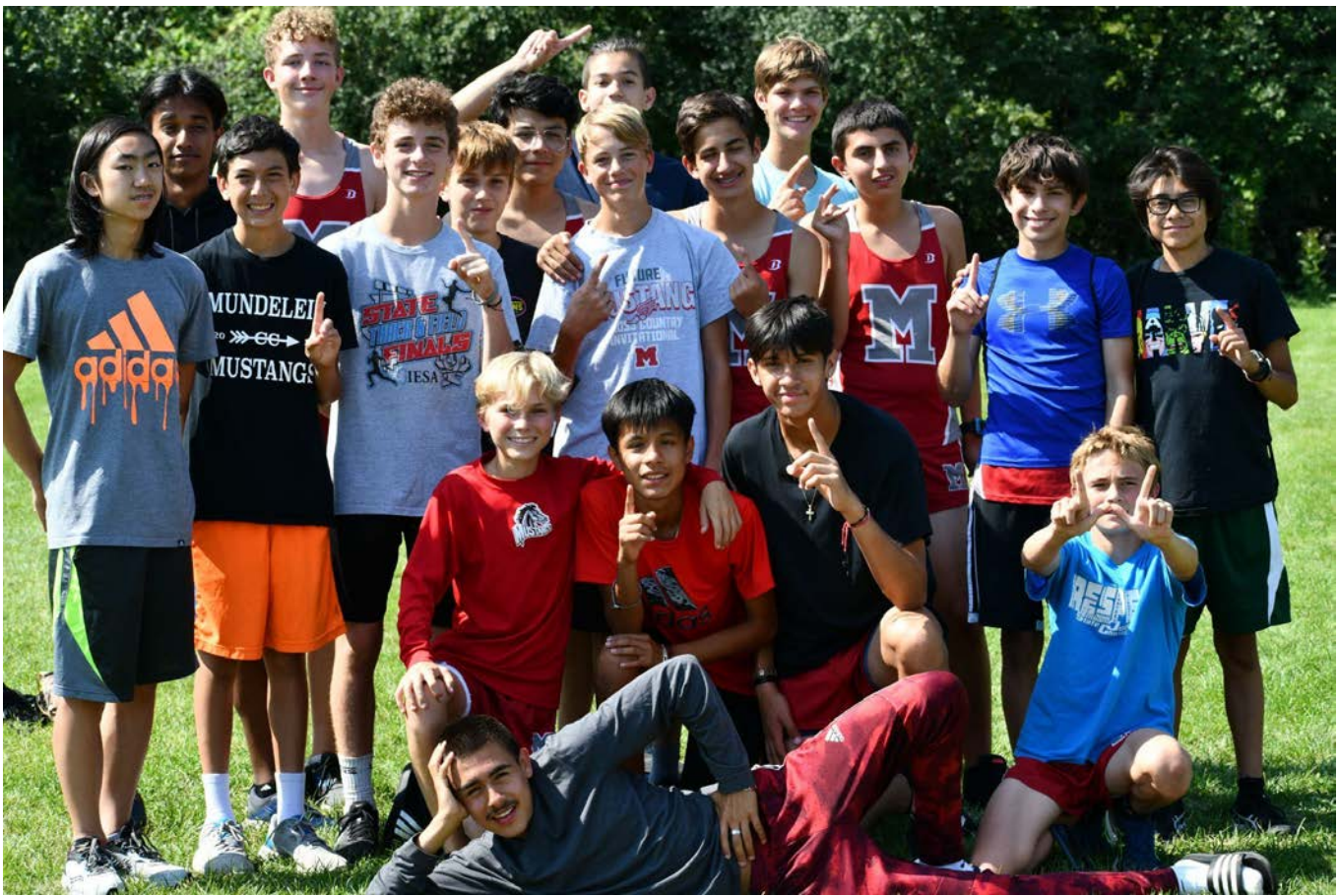
Frosh-Soph team after their first place finish

Next Meets: The team travels to the Palatine Invitational Saturday September 24 th to run against teams from across Illinois as well as some of the top schools in the Midwest. This meet has been a team favorite over the years and a showcase cross country meet in our own “backyard”. The team then returns to the home course (at the Diamond Lake Sports Complex) on Wednesday, September 28 th for Senior Night as we dual against Lake Zurich. Race time 4:45pm. Come check it out!