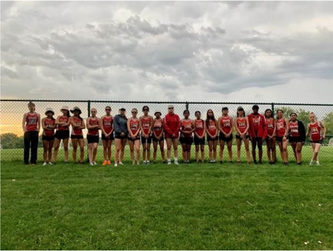
Day #2: Hats and Shades Day