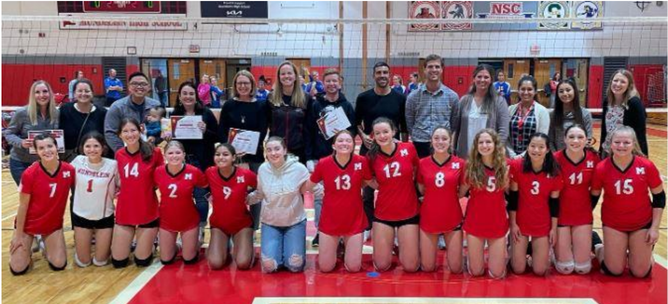
Teacher Appreciation Night

At the Libertyville home match on Monday, the Volleyball program is hosting a Cancer Awareness Night. There will be a 50/50 raffle and themed baskets to win. We will also be selling t-shirts. All proceeds will go to the Lynn Sage Foundation ( link ) Please mark your calendars and join us for this special event.